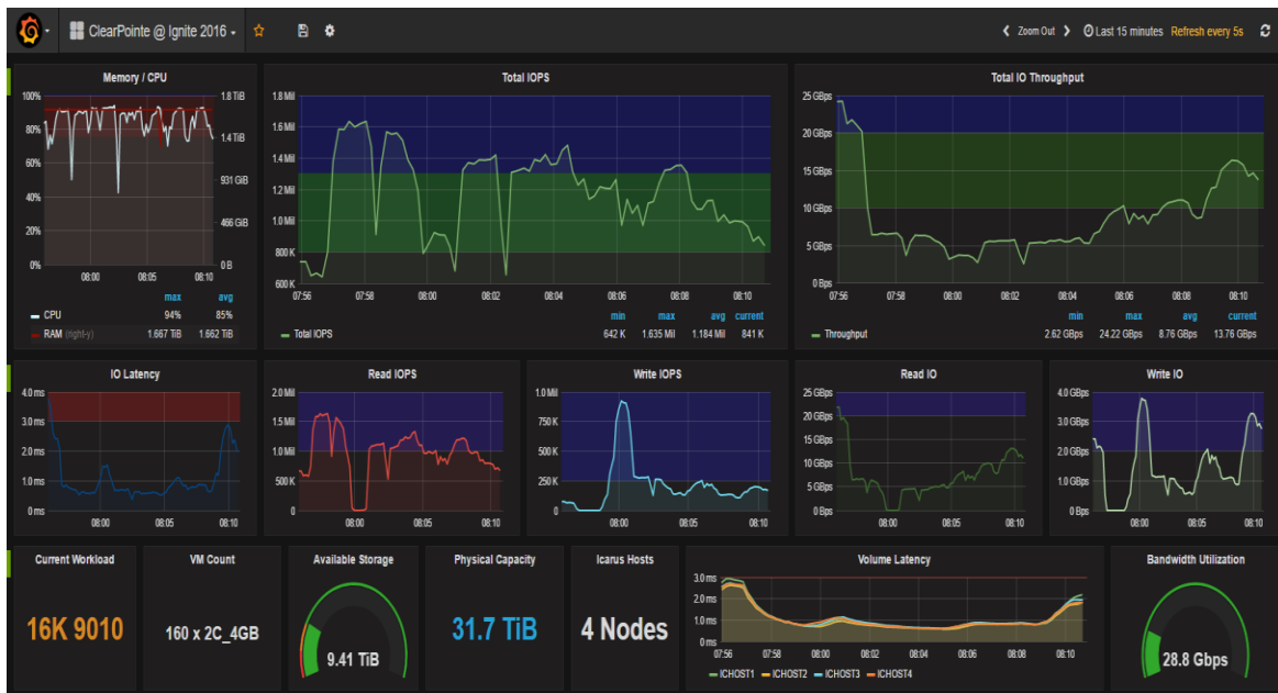
Figure 3 - Storage Spaces Direct Performance Numbers

A 40 virtual machines per node, for a total of 160 virtual machines configuration was used for this setup. Each virtual machine was configured with 2 vCPU and 4GB RAM. VMFleet tool was used to run DISKSPD in each of the virtual machines with various multi-threaded workloads from 4KiB to 32KiB IO size, mixed between 100 % READ and 100% WRITE, all random patterned.