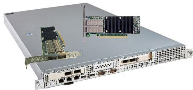
Figure 1 – QDF2400 REP Server and T6 adapters

Chelsio Unified Wire's leading-edge performance and efficiency for networking, storage, and security applications combined with the Qualcomm Centriq 2400, the world's first 10-nanometer server processor, offer a complete best-of-breed 64bit Arm-based infrastructure for cloud datacenters. The coupling of the Qualcomm Centriq 2400 processor based QDF2400 REP server with Chelsio's industry-leading Unified Wire adapter solution delivers compelling performance, power and total cost of ownership (TCO) advantages. This enables innovative topologies and networked computing models to address the most demanding cloud datacenter infrastructure needs.